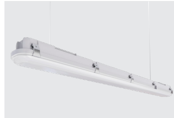
V-HOOK Suspended Mount