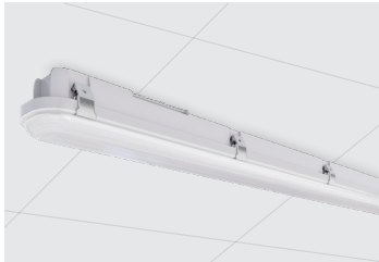
SM Surface mount